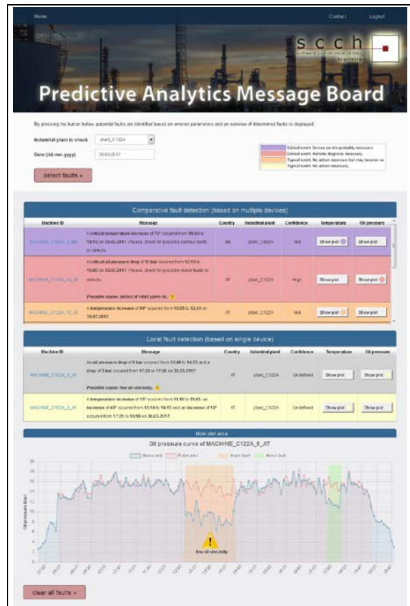
Fig. 2: Predictive Analytics Message Board

Navigate to http://www.scch.at/en/projects-das for additional information about projects at the Software Competence Center Hagenberg regarding Predictive Analytics und Predictive Maintenance.